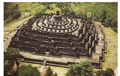
Aerial view of Borobudur

The plan of the Borobudur temple complex in Java mirrors the three main levels of Buddhist cosmology. The highest point in the center symbolizes Buddhahood.