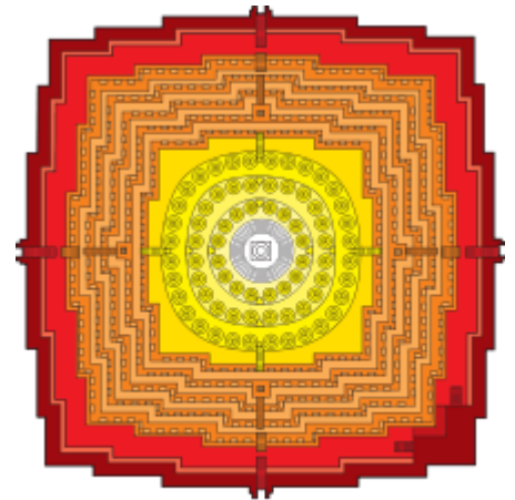
■ Kāmadhātu ■ Rūpadhātu ■ Ārūpadhātu

In some instances all of the beings born in the Ārūpyadhātu and the Rūpadhātu are informally classified as "gods" or "deities" ( devāḥ ), along with the gods of the Kāmadhātu , notwithstanding the fact that the deities of the Kāmadhātu differ more from those of the Ārūpyadhātu than they do from