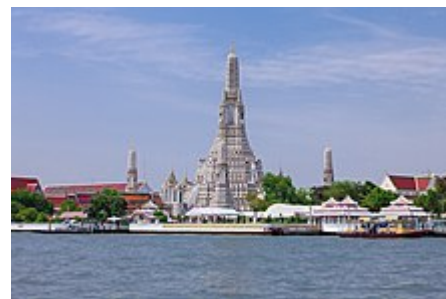
Wat Arun's pagodas were built and located to simulate the Buddhist Cosmology

The Buddhist cosmology as presented in commentaries and works of Abhidharma in both Theravāda and Mahāyāna traditions, is the end-product of an analysis and reconciliation of cosmological comments found in the Buddhist sūtra and vinaya traditions. No single sūtra sets out the entire structure of the universe, but in several sūtras the Buddha describes other worlds and states of being, and other sūtras describe the origin and destruction of the universe. The order of the planes are found